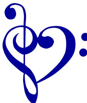
Hi-Sky Emmaus Hosts Music Workshop

Emmaus Board member and let them know you are interested in helping out!